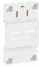
Vertical accessory for battery charger